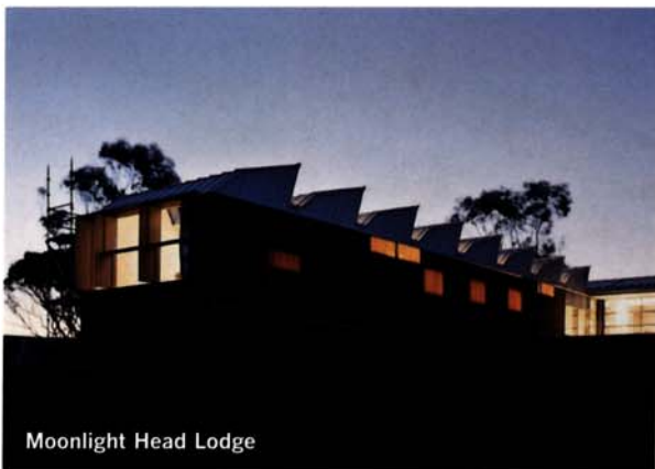
Moonlight Head Lodge

with a bleak, beautiful quotation from F Scott Fitzgerald. Colonial Africa, wild animals and Kenya's even wilder party people are featured, too. The exhibition runs from 30 November–25 January 2007 at the Michael Hoppen Gallery , London (020 7352 3649; www.michaelhoppengallery.com ). Open Tues–Sat